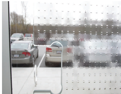
MASTER-CARRE W CUTOUT