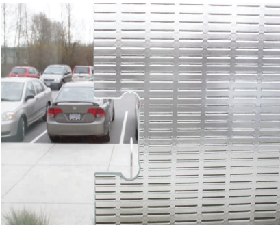
MASTER-RAY W CUTOUT