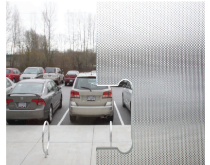
MASTER-POINT W CUTOUT